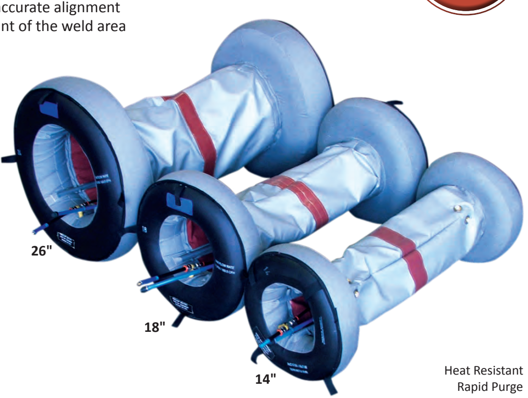
e.g. 36" Pipe will purge in less than 10 minutes!